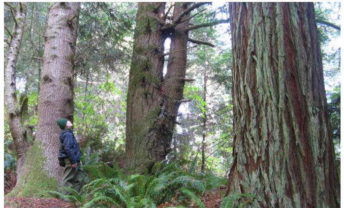
Grand Fir, Douglas-fir, and Redwood (left to right) look down on David.

disintegrate there. We compared the deeply furrowed bark of Douglas-fir, the flaky bark of Sitka Spruce, the smooth or lightly furrowed bark of Grand Fir, the red, deeply furrowed, ropy bark of Redwood, and the red, narrowly furrowed, stringy bark of Western Redcedar. We compared the flat, sharp needles of Redwood to the flat, blunt needles of Grand Fir. The size and abundance of the Sitka Spruce did not suggest, as is true, that here it is approaching its southern limit. The Western Redcedar, another species of the Pacific temperate rainforest, is also at its southern limit here.