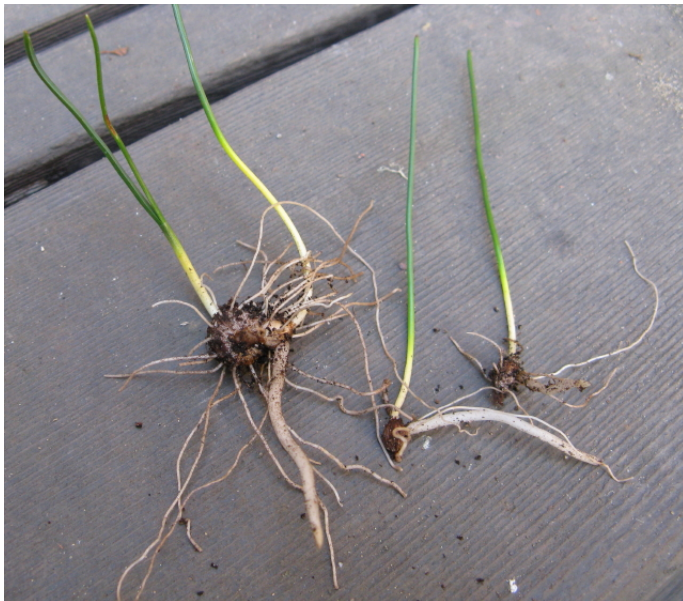
Brodiaea terrestris bulbs on November 25. Most had produced a green stem above ground. Each had produced a ring of fine, white roots. Some had produced a thick, long, white "root."

Familiar with and continually amazed by these observations, in November, when I finally got around to repotting some brodiaeas, I was excited to find some of them had a thick, white, long, fairly straight "root," as well as a halo of fine, white, squiggly roots. Surely these white "tubes" were going where the bulb "wanted" to go. Was this structure like an amoeba's pseudopod, leading the body's way? Or was this a "contractile root," a structure I had heard about from reliable sources but could not imagine? I have not researched the matter further, but I am sharing this wonder with you now. Maybe some reader will interpret the photo for us.