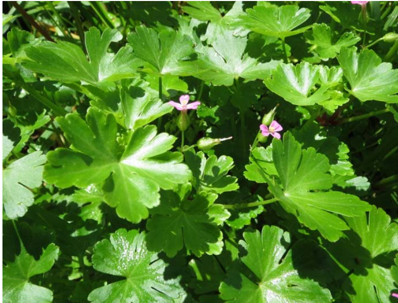
Geranium lucidum at Del Norte Redwoods State Park

savannahs in the Pacific Northwest. Camas is a North American plant whose greatest diversity lies in Oregon, which is home to over 65 percent of the named species.