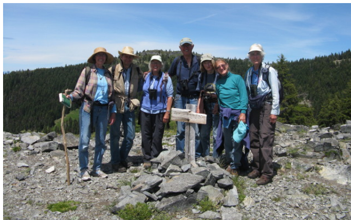
Part of our group atop Mt. Elijah

Note 1. Different sources have different names for this and surrounding trails, e.g. Lake Mountain Trail, Bigelow Lake Trail #1214, Mountain Meadows Trail and Boundary Trail, so be sure to have a map with Bigelow Lakes on it. The way to the trailhead is a bit circuitous: From Cave Junction take SR 46 to Oregon Caves. Just before the monument parking lot, turn left on Forest Service 960. After 2.7 miles, at the first major intersection, turn sharp right onto 070. At mile 3.5 stay right, still on 070. The road ends at a washout, where you park. Older books, published before the washout, will describe the trailhead as farther out this road. A 1989 Forest Service map called Illinois Valley Ranger District Siskiyou National Forest was more helpful than the common Rogue River National Forest map. A Bureau of Land Management map of the Medford District was