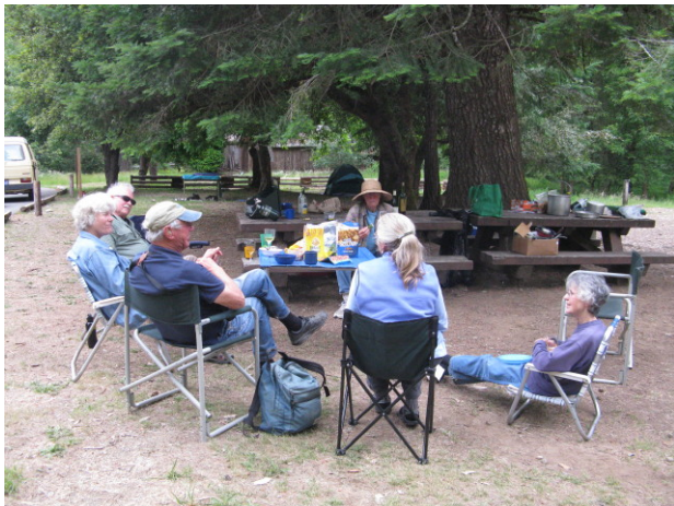
Relaxing in Chinquapin Campground

The wonderful mountain habitats of the Siskiyou, and the flowers inhabiting them, are not all in California. Some are in Oregon. Sixteen of us spent a wonderful weekend there, in the Wild Rivers Ranger District of the Rogue River-Siskiyou National Forest, and in Oregon Caves National Monument, which this forest surrounds. The district office in Cave Junction was very helpful. They have a booklet, "Trails in the Illinois Valley," showing many enticing trails. [This contrasts with our local Lower Trinity District of Six Rivers National Forest.] Most of us camped two nights in Chinquapin Group Campground, a comfortable meadow setting just off the left side of route 46 a bit past Grayback Campground (between mile markers 11 and 12), while a couple stayed at the Chateau in the national monument farther up the road.