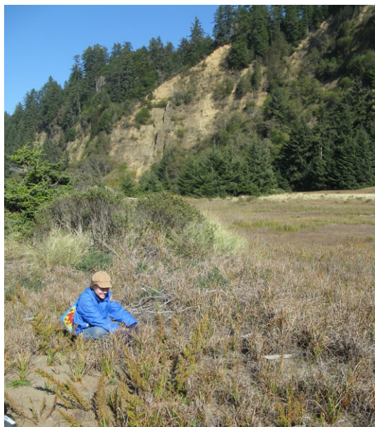
Sitka Spruce, Coyote Brush, European Beachgrass, and Mexican Tea on higher ground, with a swale of Slough Sedge between it and the Gold Bluffs.

We headed first to the pond just north of the parking area, where Home Creek widens before meandering southward in a wide floodplain and turning west to the sea. We kept an eye on an elk that was looking for plants also. The margin of the pond was a thick growth of Slough Sedge ( Carex obnupta ) laced with Silverweed ( Potentilla anserina ), Water Parsley ( Oenanthe sarmentosa ), rushes ( Juncus spp.), and Three-ribbed Arrowgrass ( Triglochin striata ). Other common aquatics were Duckweed ( Lemna sp.), Marsh Pennywort ( Hydrocotyle ranunculoides ) and Lilaeopsis occidentalis , a succulent, grass-like umbellifer. I spotted one Water Hemlock ( Cicuta sp.), a deadly poisonous (to eat), native umbellifer.