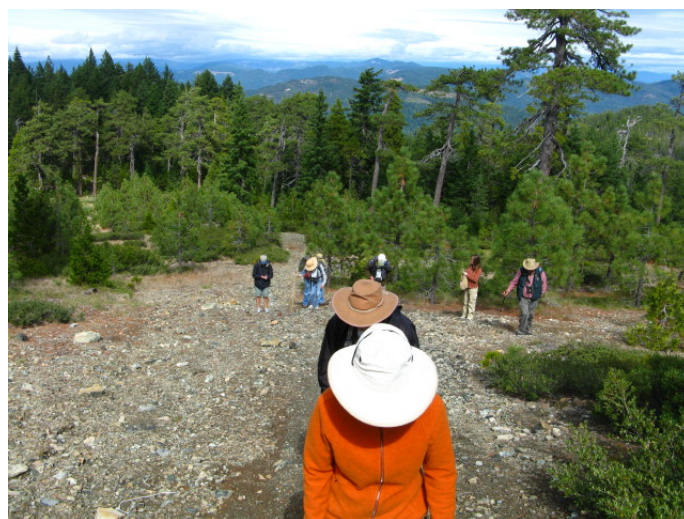
Walking up the ski slope on Horse Mountain.

Some of us then continued south along Titlow Hill Rd. to Cold Spring. (7.8 miles from Highway 299 turn right on small, dirt