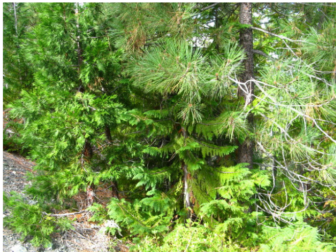
Left to right: Incense Cedar, Port Orford Cedar, and Jeffrey Pine along Indian Butte Rd.

On a fine but cool fall day our group of 9 headed for that wonderful, mountain habitat only 45 minutes away, Horse Mountain area along Titlow Hill Rd. (Forest Highway 1) in Six Rivers National Forest off Highway 299.