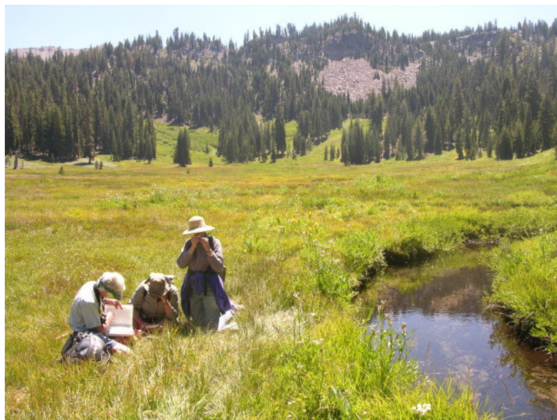
The Jepson Manual, the Lassen flora, and a hand lens in Paradise Meadow

The second all-downhill hike was from roadside marker no. 27 about three miles to Hat Lake, at roadside marker no. 42. The first half of this route we walked without distraction, through open stands of mountain hemlock Tsuga mertensiana and some magnificent western white pine Pinus monticola . A steady flow of butterflies, all morning, all flying south, impressed us. (Later information said it was dispersal.) Where we could have spent the whole day was at Paradise Meadows, just upstream from the stream crossing. The stream-side vegetation was again rich, here bedecked with dainty violet sprays of brooklime Veronica americana and rounded leaves of stream saxifrage Saxifraga odontoloma . Among the short sedges and grasses of the meadow we identified the white, narrow-rayed "aster" as Coulter's daisy Erigeron coulteri and the solitary, purple "aster" with long leaves as alpine aster Aster alpigenus . In the long grass at the edges of willow thickets were the treasured leopard lilies Lilium pardalinum , tall, regal, and glowing.