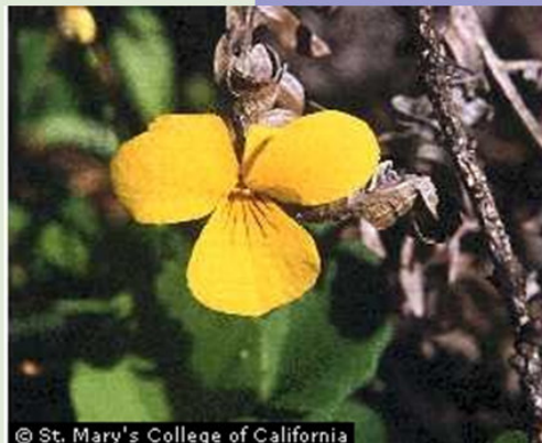
© St. Mary's College of California

Photograph of Viola sempervirens (Evergreen Violet) by Brother Alfred Brousseau Courtesy St. Mary's College of California