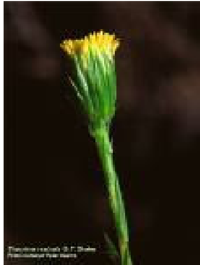
Tracyina

In spring 2008, through a cost-share agreement between the CNPS North Coast Chapter and the U. S. Forest Service, several members of the Sanhedrin Chapter participated in surveys for Tracyina rostrata , a rare annual species (CNPS List 1B.2) in the Asteraceae [Compositae; sunflower family]. We initially looked for plants at known occurrences at the Hopland Research and Extension Center (HREC), where the plant has been observed most years over the past decade, in order to develop a better sense of the species in its habitat. We then turned our eyes to Mendocino National Forest (MNF), where we surveyed grassland and oak woodland areas identified through the application of a Tracyina habitat model developed from environmental data from known occurrence locations.