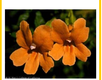
Bush Monkey Flower Mimulus aurantiacus

Blue-eyed Grass Sisyrinchium bellum