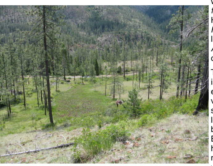
View down a Darlingtonia fen in the Jeffrey pine woodland at Days Gulch.

along Eight Dollar Mountain Road, along the south side of that mountain and beyond, all the way to Babyfoot Lake. This road passes through "the largest serpentine outcrop in the nation" (TJHowell Botanical Drive pamphlet on www.highway199.org). We passed up the new botanical trail, a boardwalk through a fen (a non-acidic wetland with flowing water. A boggy place, but technically bogs are acidic and lack an outflow.), in favor of less easily accessed, feeton-the-ground sites. First we stopped briefly at the pull-out and kiosk just before the bridge over the Illinois River. The slope above the road was Jeffrey pine