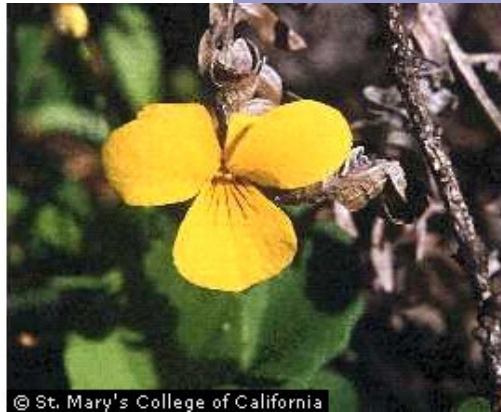
© St. Mary's College of California

Photograph of Viola sempervirens (Evergreen Violet) by Brother Alfred Brousseau Courtesy St. Mary's College of California