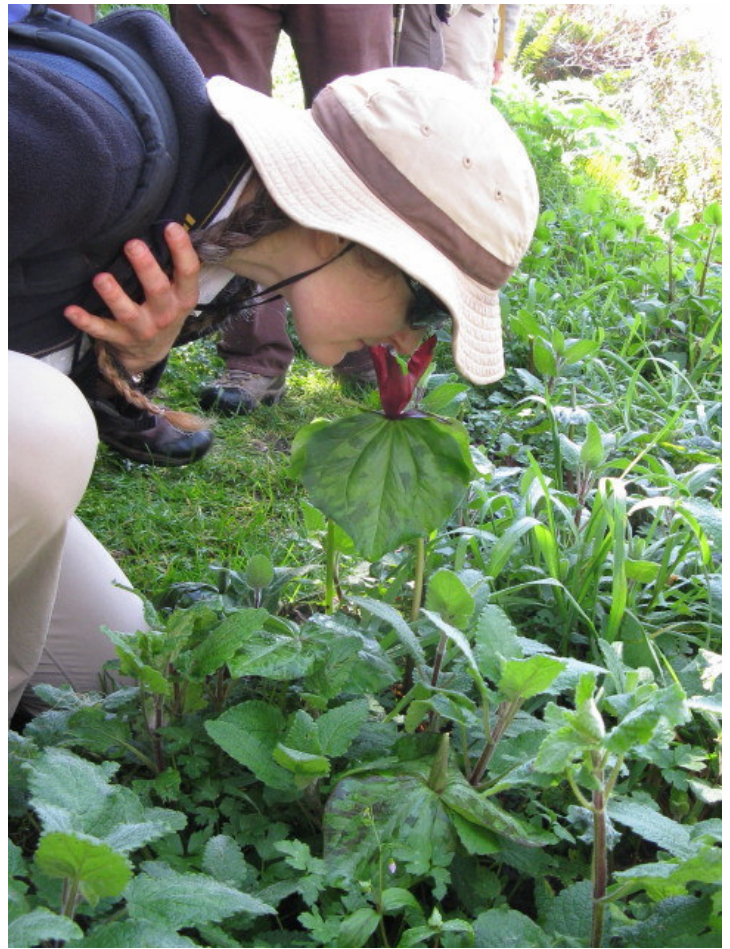
Sweet, spicy? or Foetid , musty?

lucida , smelled.....like angelica! I obviously need to work on these odors. Is there a color-wheel equivalent for odors? Something with which to standardize noses?