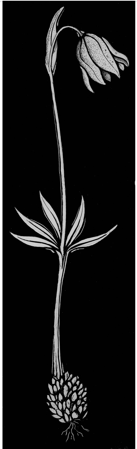
Original Illustration Courtesy of Fred A. Sharpe: Prairie Chocolate Lily