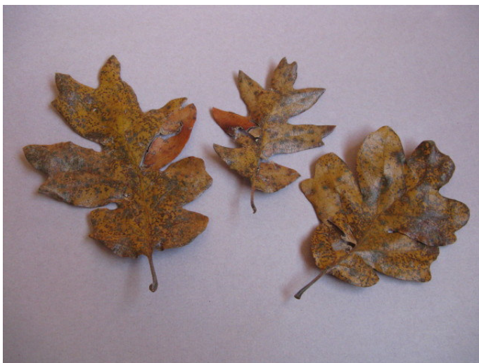
Leaves of a confusing oak

The turnoff to Ammon Prairie is 7.7 miles from Highway 299, marked by an unofficial metal sign. In