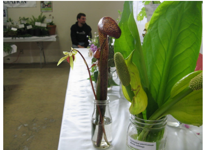
California pitcher plant Darlingtonia californica meets skunk cabbage Lysichiton americanus at the wildflower show.

For being easy landlords: Manila Community Services District