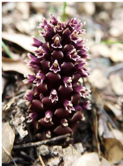
California ground-cone Boschniakia strobilacea .

The trail beyond Coon Creek, which required some jumping or wading, angled up through an older forest with rich ground cover including white-