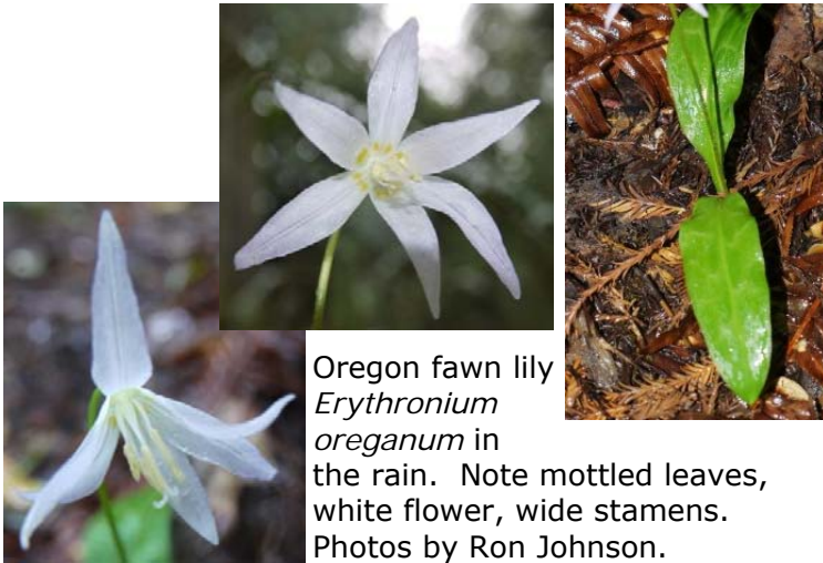
Oregon fawn lily Erythronium oregonum in the rain. Note mottled leaves, white flower, wide stamens.