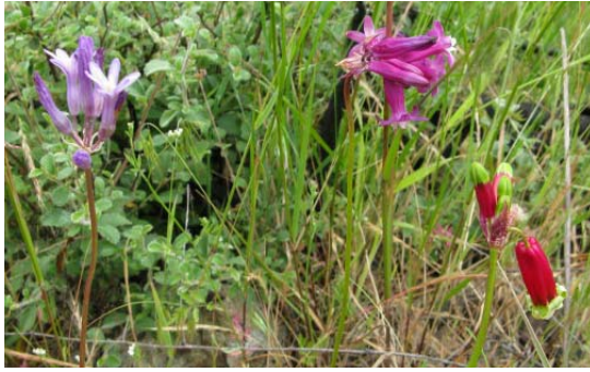
Round-toothed ookow Dichelostemma multiflora , hybrid D. venusta , and firecracker flower D. idamaia , growing naturally together

Most of us continued around the corner into the next drainage, Hell's Half Acre Creek, and took the trail diagonally down across a grassy, gravelly slope to Hell's Half-Acre Creek, whose clear water was rushing down its rocky bed in a steep-sided canyon. On a small gravel bar under white alders Alnus rhombifolia , cleared for the moment of poison oak by the fire, we rested and filled our water bottles. Some of us continued up the other side on a remarkable trail carved out of the cliff face. Rock plants-- lewisia, sedum, silene--were eye level. The shelf of the trail seemed a favored perch for Lomatium californicum , whose large umbels of tiny, yellow flowers or large, green seeds hung boldly over the precipice, anchored in tussocks of gray-green, celery-like and celery-odored leaves. The curious little yellowy purple flowers of the parasitic naked broomrape Orobanche uniflora were on the inboard side of the trail. Where the trail rounded the end of the cliff to descend across another slope to the campground by the river, at 3:15 we regretfully reversed course. We covered the roughly 3 miles to the cars in three hours.