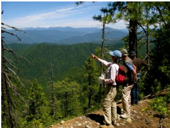
View of the Trinity Alps from the proposed Trinity Vista Trail on Horse Mountain.

The Ad Hoc Committee for Horse Mountain Trails, including our chapter, has coalesced to remedy this situation. The district ranger has told us that Six Rivers National Forest is ready to focus on recreational use of the forest, and they are delighted to hear from hikers. They hear often from off-road vehicle drivers. It is time for the botanizers, bird watchers, Sierra Clubbers, senior hiking groups, student hiking groups, and lone hikers to tell the Forest Service what they need.