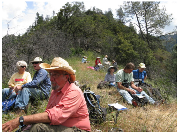
Lunch in the Klamath Ranges on the American Plate overlooking the South Fork Trinity River to the North Coast Ranges on the Pacific Plate.

Three hours from the trailhead, where the trail rounds a bend into the next drainage, was our scenic and obvious lunch spot. We settled among small, yellow poppies lacking collars Eschscholzia sp., the tiny, white flowers on thread-thin stems of a sandwort Minuartia sp. (We saw the three valves of its fruit.), and a clarkia with a dark pink spot on the clear pink petals, Clarkia purpurea . Below and in front of us was a rocky ridge splotted with bright yellow wallflowers Erysimum sp. We contemplated the larger ridge across the South Fork Trinity River, which was far below us. According to The Jepson Manual we were sitting in the Klamath Ranges on old, metamorphic and plutonic rocks, gazing at the North Coast Ranges, made from the sedimentary Franciscan Complex.