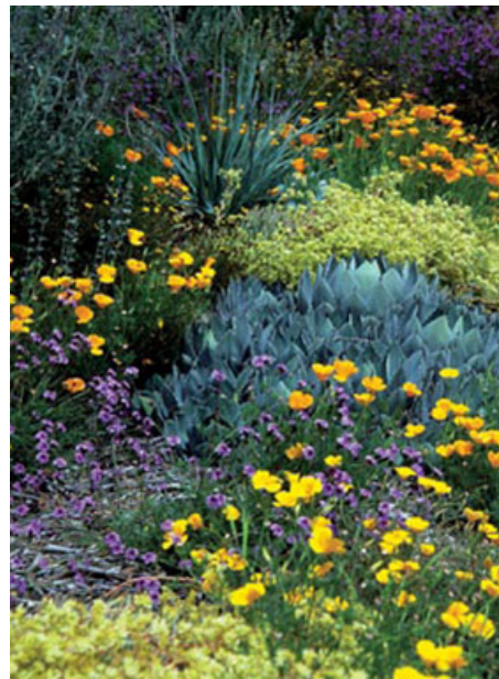
Flowering bright green dudleya ( Dudleya virens ssp. hasselii ) and bear grass ( Nolina parryi ssp. wolfii ) add texture and form to a vibrant native garden.

other beneficial insects are "made for each other." Research shows that native wildlife clearly prefers native plants. California's wealth of insect pollinators can improve fruit set in your garden, while a variety of native insects and birds will help keep your landscape free of mosquitoes and plant-eating bugs.