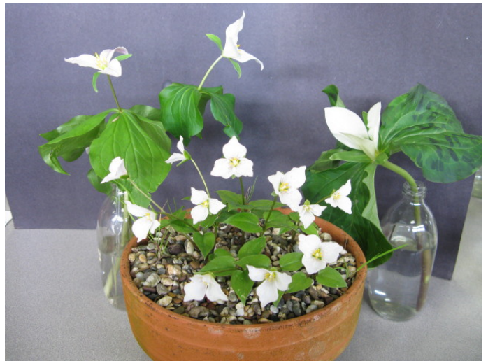
An unusual concurrence of the three local, white trilliums: Trillium ovatum , Pseudotrillium rivale , and Trillium albidum .

With a wildflower show every year for 28 years, could a person be bored with them? No! While maintaining certain traits through the years, each one is different. Given the variables of weather, date, and how many collectors are collecting where, the array of flowers is sure to differ. Then there are new arrangements of the room, new displays around the sides, new speakers, and new music at art night. Regular visitors can refresh memories of floral friends. It may be their only chance to see a calypso this year, bringing memories of some forest glen where they first saw this gem. Students of plant identification can profit from finding side-by-side species that would never be adjacent in nature, such as three species of white trilliums. Frequent visitors may notice something missing -- "What?! No false dandelion ( Hypochoeris )?!"-- while first-time visitors stop in awe, "I had no idea this show was so magnificent!"