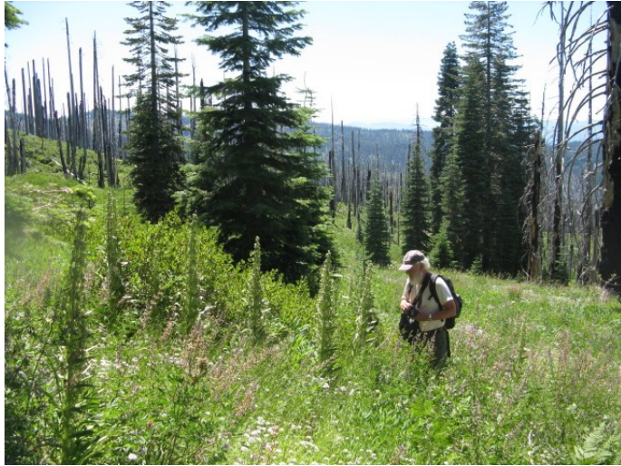
Admiring the monument plant in a sea of hackelia and coyote mint. Note the many snags from the 1999 fire.

Enticed by the butterfly fame and montane location of Waterdog Lake, on a perfect summer day twenty CNPSers and Auduboners caravanned up the dirt roads out of Hoopa into the western side of the