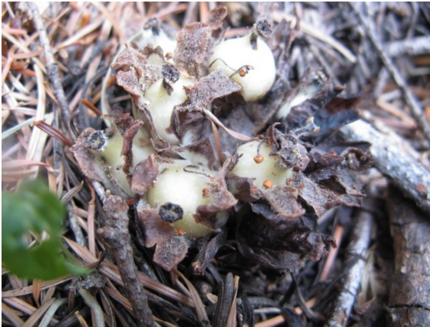
California pinefoot. The hairy, unfused petals are still clear around the swelling fruit.

glory: leopard lily ( Lilium pardalinum ), monkshood ( Aconitum columbianum ), mountain boykinia ( Boykinia major ), white-flowered bog orchid ( Platanthera dilatata var. leucostachys ), butterweed ( Senecio triangularis ), tinker's penny ( Hypericum anagalloides ). What a delightful surprise, this sheltered pocket of moisture on a summer-dry landscape! How had all these denizens of wet places arrived at this tiny patch of reliable moisture? As a final touch at the edge of the clearing, under a fir, was a dirty white mycoheterotroph that barely emerged above the duff. It was pinefoot ( Pityopus californicus ),