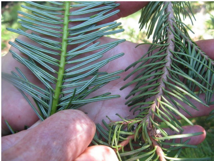
White fir (left) with straight needle bases and noble or red fir (right) with J-shaped, or "hockey stick" needle bases.

Down a rock-strewn slope from the crest, through one more stand of dark green firs was our destination, a green bowl with a shallow pond beside its one large rock, complete with newts (waterdogs). No cows had ravaged the sedgy sward...yet this season. A large patch of corn lily ( Veratrum sp. ) anchored one side of the bowl. Bistort ( Polygonum bistortoides ) stuck its oblong, white balls of tiny flowers up for pollinators to find. An aster, a monkeyflower ( Mimulus sp. ), and a butterwort ( Senecio triangularis ) added small touches of color. Having heard that a gentian was here, I inspected a dense cluster of fresh, green leafy stems with round, opposite, sessile leaves and three large flower buds crowded among the stem-tip leaves. I'm sure this was Klamath gentian ( Gentiana plurisetosa ).