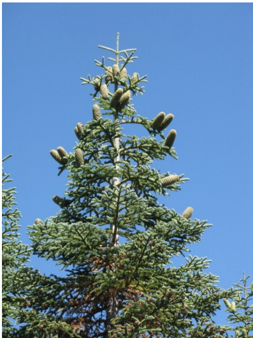
Large cones of noble fir or Shasta red fir. As in all true firs (as opposed to Douglas-fir), the cones sit upright on the branches and disintegrate there.

Some of us took the "fir challenge," focusing on the trees we passed. From the flat-sprayed, small-coned white firs we progressed into the tight-sprayed, large-coned firs that could be red ( Abies magnifica ) or noble ( Abies procera ). These higher elevation firs had J-shaped needle bases, grooves on the top sides of the needles, and exerted bracts entirely covering the surfaces of the cones. In some books these characters would make it noble fir. The newest The Jepson Manual distinguishes Shasta red fir ( A.