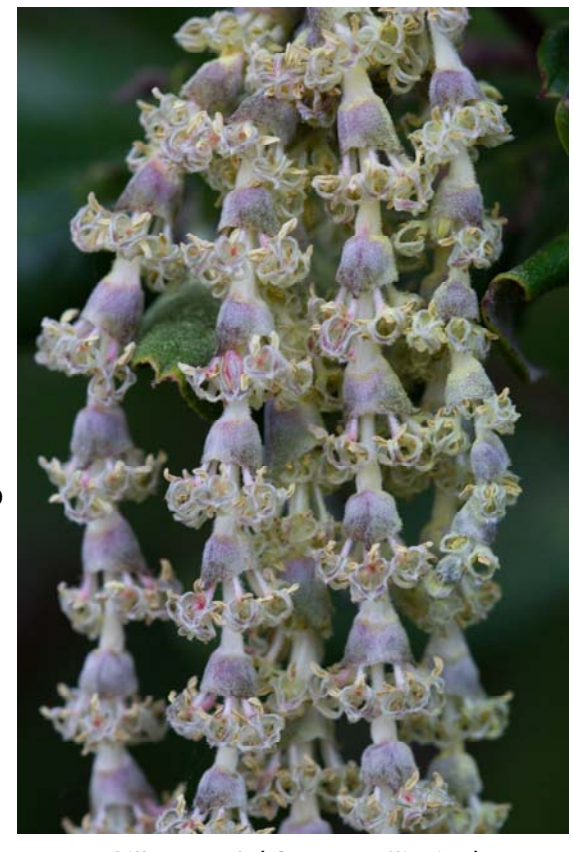
Silk tassel (Garrya elliptica)

Winter may not be everyone's favorite time of year to garden, but at the very least, get out there and enjoy the special beauty that the winter landscape affords us.