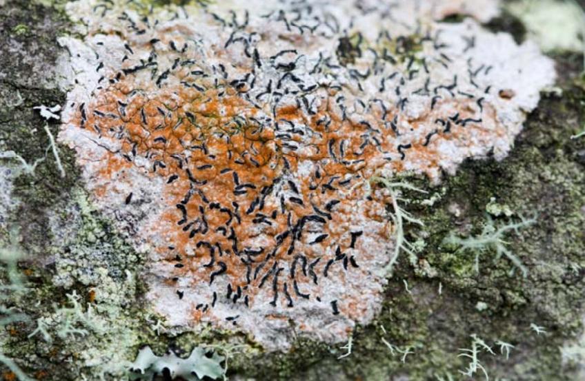
Lichen on red alder (Alnus rubra)

Two shrubs that flower in the winter, silk tassel ( Garrya elliptica ), a broadleaf evergreen, and California hazelnut ( Corylus cornuta ), a deciduous broadleaf, provide color at a time of year when we least expect it. Coastal silk tassel, particularly the selections "James Roof" and "Evie," can produce masses of male