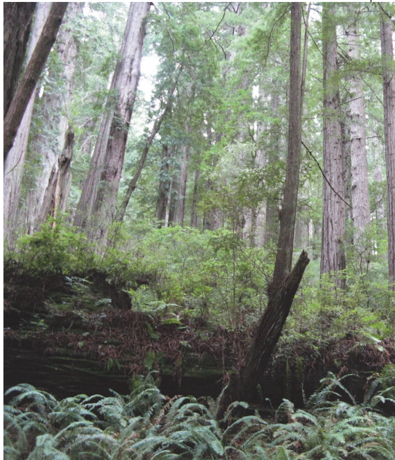
The majesty of the redwood forest along Flint Ridge Trail

lost its magic. The trillium plants were smaller than in the past. The Stinging Nettle ( Urtica dioica ), grass, and other plants were larger, and household trash had appeared. Possibly some clean-up, vegetation management, and communication with the county road crew could restore this trillium population to its glory.