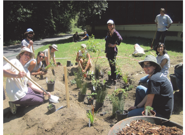
Ready to plant in the rain garden. Some of the plants donated from the North Coast Chapter of CNPS.

Volunteers planted a rain garden, installed a rainwater catchment system, and built a hugelkultur bed. A rain garden is a depressed area with native plants that helps increase water infiltration into the ground and decreases runoff from paved surfaces. This increases the amount of water in our streams in the