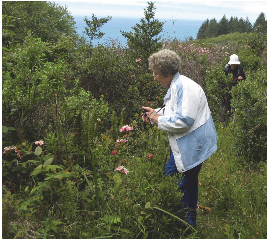
Admiring azaleas along Stagecoach Hill.

Azaleas were in three general areas: between the parking area and the creek, beyond (west of) the creek, and east of the road (Azalea Rd.). The first area has in memorable past (of a local resident) been totally cut down to stubs. It was now tall and thick, but the California Blackberry ( Rubus ursinus ), Coyote Brush ( Baccharis pilularis ), Cascara ( Frngula purshiana ), Red-flowering Currant ( Ribes sanguineum ), Straggly Gooseberry ( Ribes divaricatum ), Blue Blossom ( Ceanothus thyrsiflorus ), Hairy Honeysuckle ( Lonicera hispidula ), Poison Oak ( Toxicodendron diversilobum ), willows ( Salix sp.), English Ivy ( Hedera helix ), etc., and young conifers were thick along with the azaleas. The azaleas in this area didn't have much fresh growth, did have a lot of lichen-covered old stems and maybe even dead stems. The azaleas across the road were similarly crowded and old. Where some had been cut back off the trail, they had fresh stems. The azaleas beyond the creek seemed arranged along the trail, like an avenue. They were taller and less crowded, though also more shaded by nearby tall trees. Many azaleas had not fully leafed out. Besides azaleas this reserve featured several huge Grand Fir ( Abies grandis ), a huge Sitka Spruce ( Picea sitchensis ), a huge California Bay ( Umbellularia californica ), a dense,