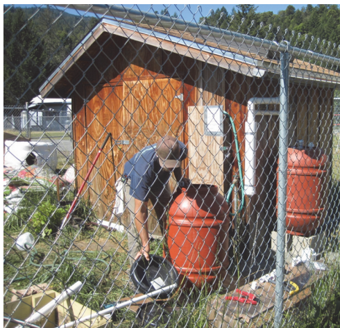
Assembling the rainwater catchment system

summer, a pivotal time for salmon populations, and decreases pollution. The California Native Plant Society and Samara Restoration generously donated around 20 plants each for the rain garden.