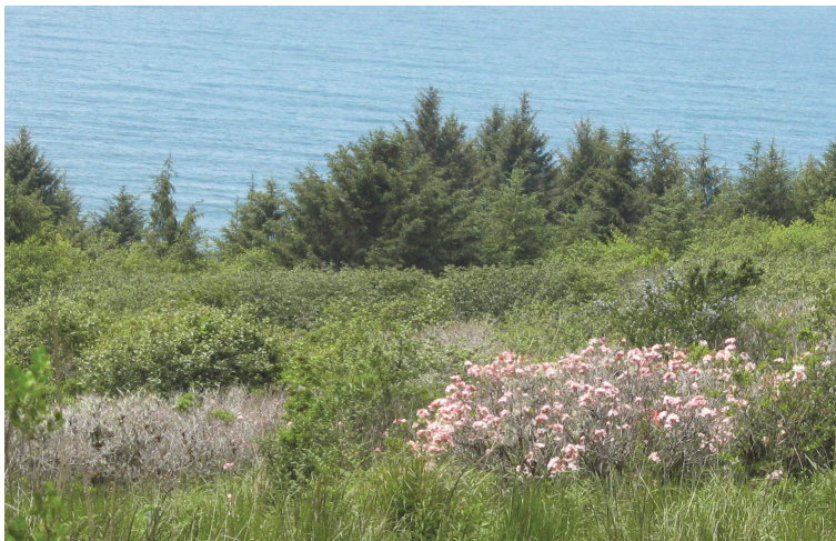
Late-May Western Azalea among the Pacific Reedgrass on Stagecoach Hill.

number, stamen number, stigma size, stigma color, flower truss size, leaf size, shape, texture, veining, color, and posture, flower bud size, shape, and color, plant habit, and blooming time. The main blooming season is May-June, but a few bloom any time from February to August. He saw an "infinite combinations of features." So what did we see, on this day in late May? For the first time I looked closely at azalea flowers. Their basic plan was 4 pink-flushed, white petals plus a top petal with a smear of yellow, with a swoop of long stamens and a pistil coming out of the center. They all smelled wonderful. I could see some differences in petal width and amount of pink or yellow. Not enough leaves were out to study their variation. Some of the azalea variation was masked by the other vegetation enmeshed in the azalea shrubs. It will take more