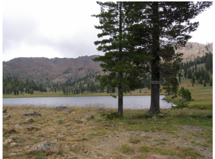
East Boulder Lake.

On Saturday East Boulder Lake was our destination. (Not to be confused with other lakes in the Trinity Alps with "boulder" in their names) We drove north to Callahan and turned south on 40N17 to 39N10 and then 39N63 to the trailhead at 5,800 ft elevation. The gentle trail took us through White Fir forest and dry, grassy clearings dotted with white heads of Parish's Yampah and Yarrow ( Achillea millefolium ) and a blue penstemon ( Penstemon sp.). Cow patties, sagebrush ( Artemisia sp.), and Woolly Sunflower ( Eriophyllum lanatum ) further distinguished these meadows from those at the summit. A four-foot tall buckwheat discovered a bit off the trail was the handsome Tall Woolly Buckwheat ( Eriogonum elatum ). Excitement rose as the trail ascended a bouldery, wet slope with a view of a waterfall down to the right. Here among the thickets of Mountain Alder ( Alnus incana subsp. tenuifolia ) was a rock garden so lush the rocks were obscured by goldenrod ( Solidago sp.), Red Columbine ( Aquilegia formosa ), mugwort