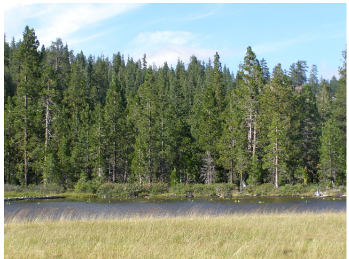
Little Carmen Lake. Photo by Anna Bernard

Most of the botanical area lay east of the road (Rte 3). We explored there Sunday morning, spending about two hours at Big Carmen Lake and 1.5 hours around the big curve in 40N08 that is about one mile from Rte 3, where 40N44 branches off downhill opposite a small quarry. Although only the south shore of Big Carmen Lake is in the botanical area, no signs inhibited us from walking through the private property around the entire lake. It is a shallow lake with some wide, grassy, sedgey, and rushy shores hosting White Rush Lilies, Sneezeweed, Checkerbloom ( Sidalcea sp.), clovers ( Trifolium spp.), Western Bistort ( Bistorta bistortoides ), Swamp Onion ( Allium validum ), and with some jumbled rock shores where Western Azalea offered some late blooms and one sharp-eyed explorer found Common Harebell ( Campanula rotundifolia ) blooming. Spike-rush ( Eleocharis sp.) and quillwort ( Isoetes sp.) grew in the water's edge, and Yellow Pond Lily ( Nuphar polysepala ) was in the lake. We did not encounter any inflow or outflow streams, though the map shows these.