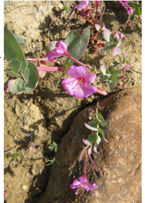
Siskiyou Fireweed.

( Artemisia sp.), checkerbloom ( Sidalcea sp.), California Cornlily ( Veratrum californicum ), Bolander's Madia, cinquefoil ( Potentilla or Drymocallis sp.), Yarrow, and more. Special mention should be made of a lush clump of Explorer's Gentian that occupied two of us a long time, looking for minute cilia or minute teeth on the calyx lobes. The less wet parts of this wonderful slope were bursting with blue-flowered lupines ( Lupinus sp.), pale yellow buckwheat ( Eriogonum sp.), robust Woolly Angelica ( Angelica tomentosa ), and cheery yellow Woolly Sunflower. Our scouts reported strong wind up at the lake, so we stopped for lunch near the stream below. This was a good choice. Nearby were clear, pink flowers among smooth, gray-blue leaves peeking between rocks--Siskiyou Fireweed ( Epilobium siskiyouense ), and by the creek were dark green, mat-forming rosettes with single, orange, daisy-form flowers on tall stems--Showy Raillardella ( Raillardella pringlei ). Both are rare plant listed 1B, rare in California and elsewhere. A handsome clump of dark green, tightly lobed, bristle-less fern leaves was Lemmon's Sword