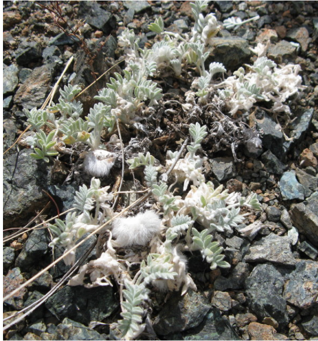
Woollypod Milkvetch. The white, fluffy object is the wool-covered, pea-like pod.

rosette of Naked Buckwheat ( Eriogonum nudum ); the yellow-flowered mats of Sulphur Buckwheat ( E. umbellatum ); and the dusty pink pompoms above rounded, gray leaves of Cushion Buckwheat ( E. ovalifolium ). We also distinguished three ceanothus: a white-stemmed, small-leaved, shrub that was Wedge-leaf Ceanothus ( Ceanothus cuneatus ); a prostrate plant with three-toothed, dark green leaves that was Siskiyou Mat ( C. pumilus ); and a low shrub with dark green leaves that remained unknown. Most intriguing were the small, woolly, gray mats with densely hairy pods of Woollypod Milkvetch ( Astragalus purshii ). Though our attention was drawn by these plants above the road (north of 40N44), only the south side of this road is in the botanical area.