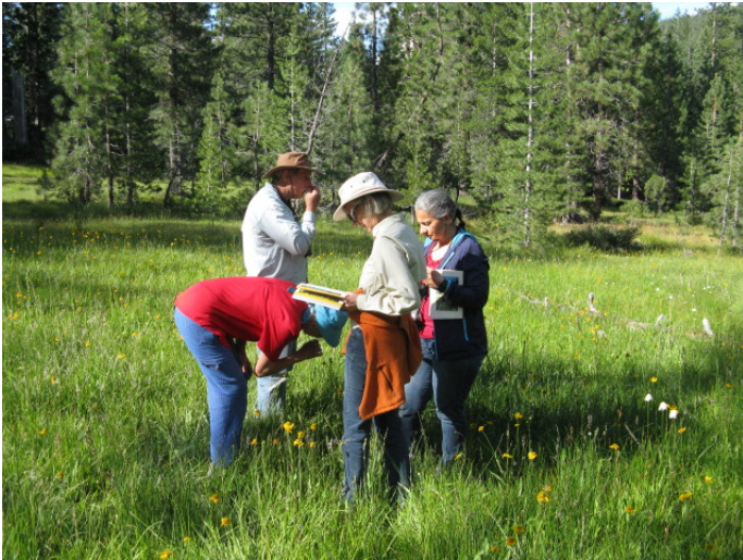
Heaven is something like this, the meadow at Scott Mountain Campground.

The Scott Mountain Campground, at the summit (5,401 ft elevation) on Rte 3 north of Weaverville is one of our favorite places on Earth. Eleven of us gathered there Friday with time to wander and marvel in the meadow before dinner and walk north of the wide, roadside pullout down another wet meadow and into a shady gully before dark. Despite the