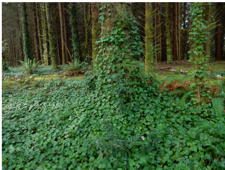
Trinidad State Park.

2. SECOND SATURDAYS , alternating parks 9:00 a.m. to 12:00 noon. Removing ivy is a moderate exercise on fairly level but uneven ground. Wear durable work clothes and sturdy field shoes. Gloves and tools are provided, or bring your own. Work sites are closer than a half mile walk from the meeting place. Heavy rain or strong wind cancels the event. For information please call Michelle at 707-677-3109 or email michelle.forsys@stateparks.ca.gov