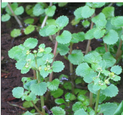
Pacific Golden Saxifrage ( Chrysosplenium glechomifolium ) in bloom

The forest was largely deciduous, still barren of leaves, so we could see into and through thickets and canopies. A canopy of Red Alder ( Alnus rubra ), decorated with dangling, male catkins, spread over vast beds of Salmonberry ( Rubus spectabilis ) or Sword Fern ( Polystichum munitum ). In one