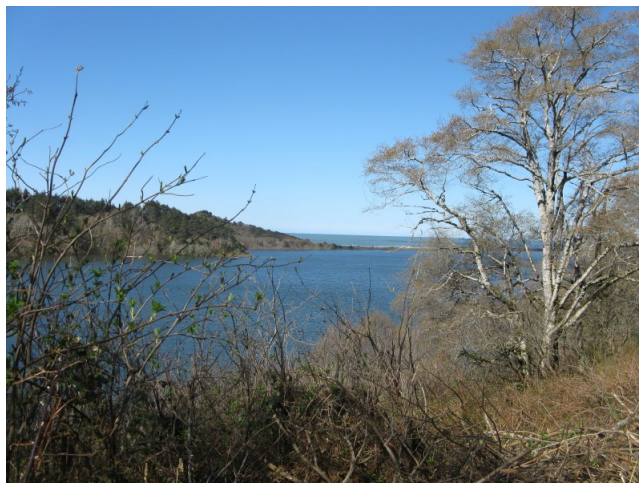
Looking over the Salmonberry, past the Red Alder to Freshwater Lagoon, the spit, and the ocean.

A sunny day in February of a soggy winter was still soggy and cold, but the sun felt good, the world underfoot was green, and water gurgled in the ditches and brooks. After shuttling a car to the north end of Old State Highway, at the south end of Orick flatlands, ten botanizers and birders walked this little-used, paved road from the south end, on the right just as Highway 101 (heading north) starts descending to Freshwater Lagoon. We spent four hours 50 minutes walking the 3.4 miles, tarrying to enjoy and study many sights.