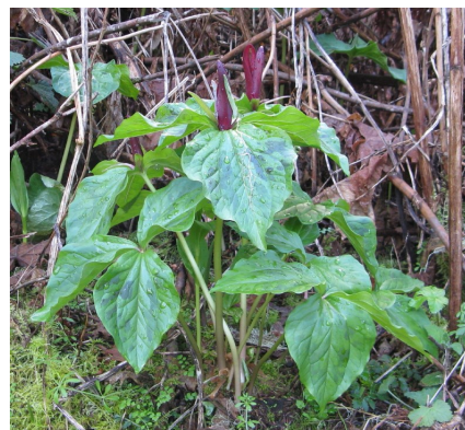
Giant Purple Wakerobin among the Salmonberry

The herbaceous plants also offered flowers. Many species had just one or two, the very first, flowers open. Other species, namely Candyflower ( Claytonia