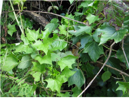
A deadly duo--Cape Ivy (pointy leaves) and English Ivy (waxier, 3-pointed leaves)--both invasive species.

our hopes, so we were excited to find it, its rich, maroon flowers pointing upward from their nests atop the collars of three leaves. They were at the top of the road bank, in