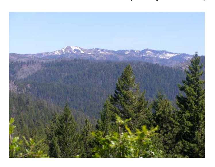
View from the Boundary Trail