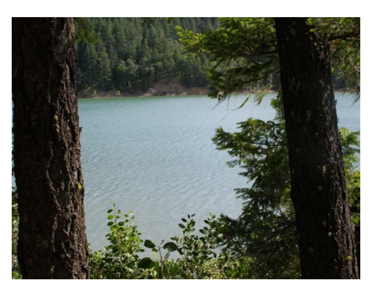
View of Ruth Lake from the Nature Trail