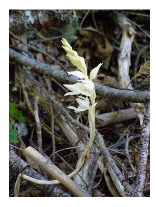
Phantom Orchid at Boundary Trail