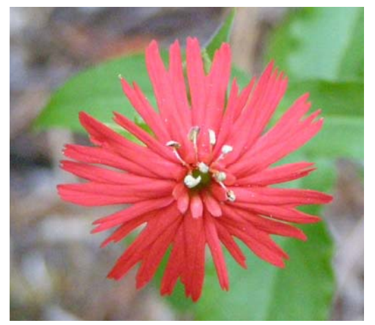
Indian Pink on the Nature Trail