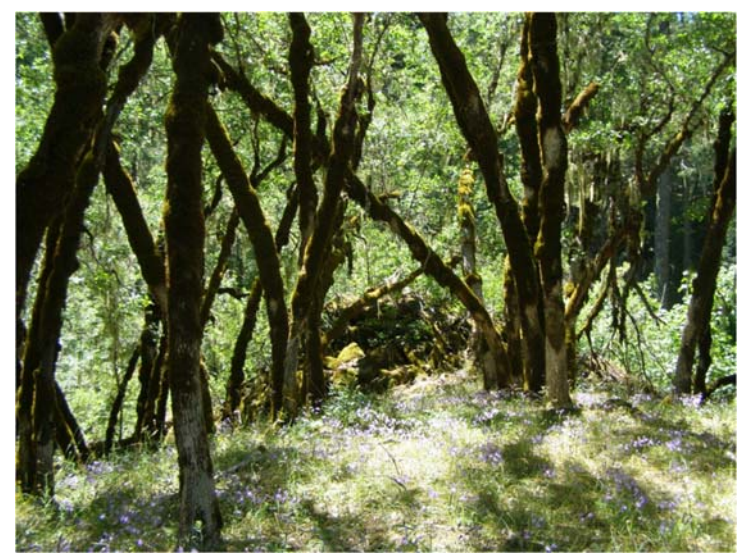
Mossy rock and Ithuriel's Spear ( Triteleia laxa ) in a grotto of Oregon White Oak ( Quercus garryana ) on the Glover Gulch Trail. Ithuriel's Spear was blooming most places we went and along the roads. It is a pale violet version of this species, with a sparkly throat, and stamens at two levels.