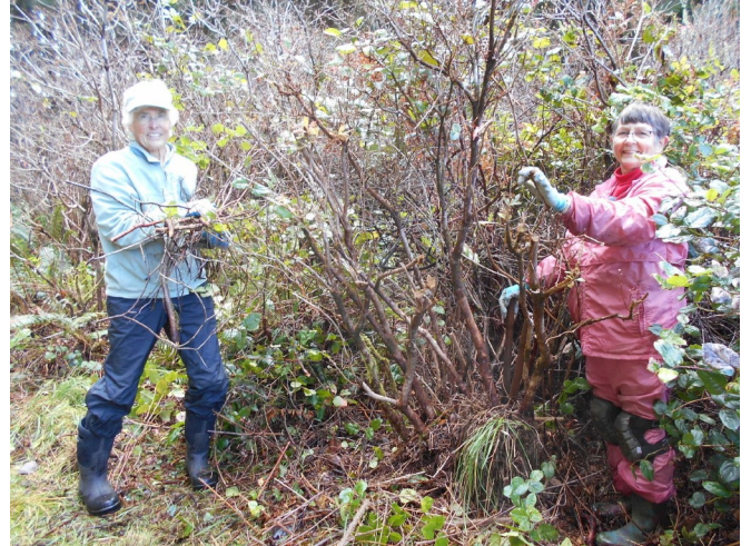
CNPSers cheerfully removing native plants from among the Western Azalea at Stagecoach Hill.

looking good--cleared of Salal, Calif. Blackberry, Salmonberry, Cascara, Nootka Rose, and very tall, dead Bracken fronds. Yes, we are removing native plants! Yes, their encroachment is a natural process, but no, it is not the natural state of things. Frequent fire and grazing were the natural state that maintained the coastal prairie and the azaleas. Our clippers were crudely mimicking these natural processes. We did not prune the azaleas themselves, although the azalea experts all agree that hard pruning, as it would experience in a fire, refreshes an azalea.