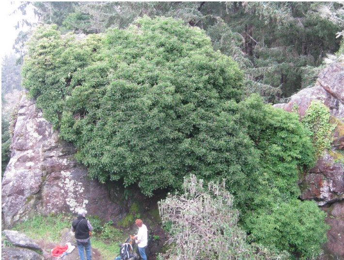
Before: Volunteers intent on removing it assess the robust, fruiting canopy of English Ivy on the rock beside the stairs ascending Ceremonial Rock.

On March 10, as American Robins flew by, clucking their distress at seeing their breakfast site under attack, volunteers proceeded with dismantling a large part of the English Ivy on