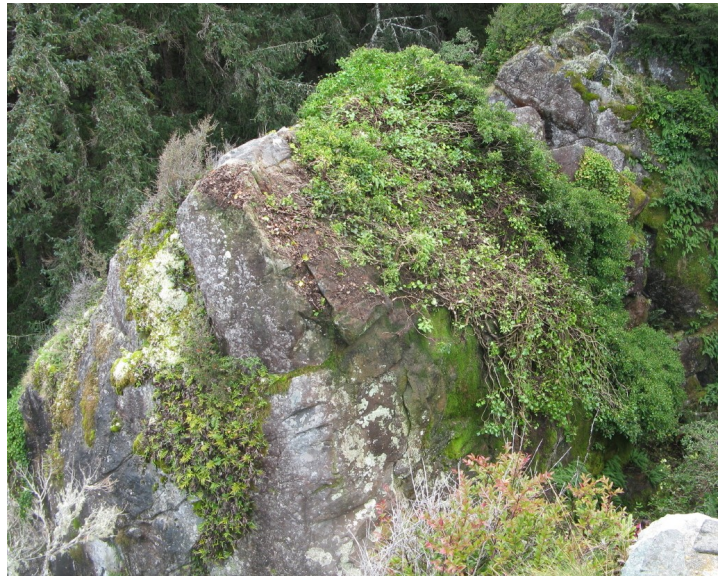
After: With the bulk of the fruiting canopy removed, the creeping, clinging trunks and branches of ivy are accessible for the next work

CNPSers were on the front line among the 15 or so volunteers at this California State Park work day. It was a long-awaited day, for this green tide of invading ivy to be fought back on this central, important landmark at Patrick's Point.