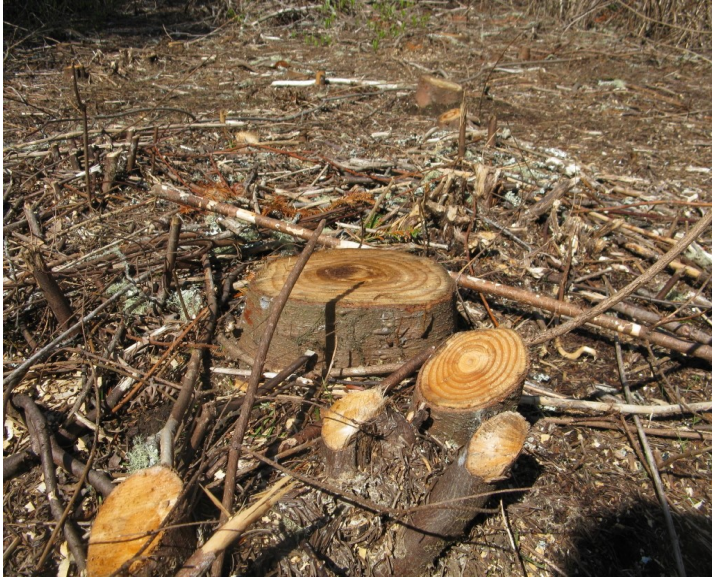
Light, air, and bare ground were restored among some azaleas at the Azalea State Reserve. Stumps of fast-growing Sitka Spruce (See those growth rings!) will not re-sprout. Stumps of cotoneaster or California Hazel will.