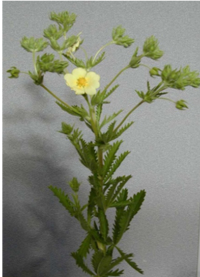
Sulfur Cinquefoil [ https://www.kingcounty.gov/services/environment/animals-and-plants/noxious-weeds/weed-identification/sulfur-cinquefoil.aspx ]

If you would like to help us with quality control, please come see us! If you are good at plant ID and would like to collect seeds for us locally (in Humboldt County), please talk with us. We could use some seeds of either Sticky Cinquefoil or Slender Cinquefoil ( Potentilla gracilis )!