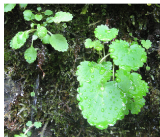
Green rosettes of California Romanzoffia (left), an unknown species, and Mertens' Saxifrage on the mossy rocks.

The day was also rich in the miner's lettuce family ( Montiaceae ), for the extent they covered the gravelly, humus-filled substrate. These were Candyflower ( Claytonia sibirica ), Small-leaved Montia ( Montia parvifolia ), and Montia fontana . We have seen the rare Montia howellii here on other visits.