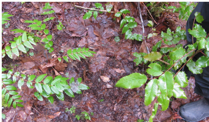
Low Oregon-grape (left), showing the many, orderly, flat, unsymmetrical leaflets, and Large Oregon-grape (right), showing fewer, less regimented, more symmetrical leaflets.

( Cornus sessilis ). Farther up the narrow canyon magnificent, large Big-leaf Maples ( Acer macrophyllum ), Douglas-fir ( Pseudotsuga menziesii ), and Port Orford-cedar ( Chamaecyparis lawsoniana ) added grandeur to the otherwise fast-paced life of the alders along the creek. A "field guide special" was finding Low Oregon Grape ( Berberis nervosa ) and Tall Oregon-grape ( Berberis aquifolium ) growing side-by-side, to compare their leaflet arrangements.