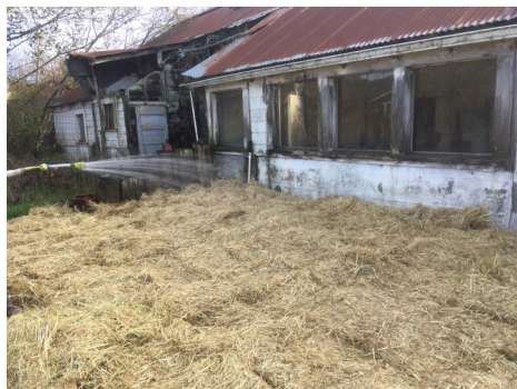
Left, laying down layers of rice straw in preparation.

For more resources on the importance of planting natives and additional gardening guides, things are always being added to the CNPS website: https://northcoastcnps.org . If you're interested in volunteering at the nursery or in the garden, or you have questions for our Native Plant Consultants about how to start your own project, contact us at northcoastcnps@gmail.com .