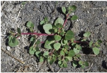
Red Goosefoot

On the shore, only in the zone recently exposed, was a mystery plant which I recognized from photos sent me from Big Lagoon in September a previous year. It was a small, herbaceous plant spreading its red stems on the ground from a central point, with succulent, green leaves and no clues to flower arrangement or structure. Searching around we found a few with tiny flower buds clustered close to the stem. Only later, at home, using the "brute force" method of identification (reading all the descriptions and looking at all the pictures in the genus you suspect it is), did I deduce this humble, late-growing plant is Red Goosefoot ( Chenopodium rubrum var. humile ). This is a non-native variety of a species with a native variety as well, which is erect with lobed leaves. Goosefoots are one of the plant groups that invest very little in flower show.