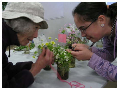
A meeting of the minds at the flower show...