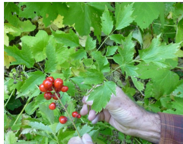
Baneberry-toxic to people

This half-mile section of dirt road provided plenty of botanical entertainment. We saw a good show of the fall fruits the mountain offers to migrating birds. What will the Mountain Dogwood look like in the spring? When will the Mountain Larkspur delight us with blooms? What is beyond that, around the next bend? PS: Despite it being hunting season, we heard no shots and saw no hunters.