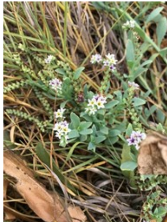
Seaside heliotrope

After eating lunch by the driftwood, watching the waves, we walked north along the toe of the bluff. The less rocky parts were densely covered by a mix of herbs and shrubs. I was pleased to see in an accessible place the dried, prickly stems of an annual I had seen here before and at Moonstone Beach but couldn't reach. Using again the brute force ID, I concluded this was Stinging Phacelia ( Phacelia malvifolia ), which I hope to see in bloom some day. The rocky outcrops of the bluff were studded with a succulent, which I won't mention by name, to prevent plant poachers from Google-searching for it. Catching the cold, salty ocean winds on the bluff, along with Coast Strawberry ( Fragaria chiloensis ), wind-swept Sitka Spruce ( Picea sitchensis ) and Coyote Brush was a dispersed patch of Elegant Rein Orchid ( Piperia elegans ), a dramatic demonstration that our native orchids are much hardier than the tropical houseplants people associate with the family. This less-developed corner of our state park provided a satisfying diversity of plants for very little walking.