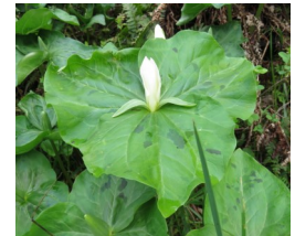
Giant White Wakerobin on the Patterson Rd. roadbank

On the roadside along the upper stretch of Patterson Rd. we found a lush clump of Giant White Wakerobin ( Trillium albidum ). This species prefers oak woodland. There it was under California Black Oak, but the shrubbery and young Douglas-fir had grown up so much it couldn't be called woodland. The trillium was appreciating the greater light and lower competition it found on the mowed side of the road. This is the story of much of our oak woodlands. Now "protected" from both fire and grazing, they are being swallowed up by the evergreen forest, a serious loss to the biodiversity of Humboldt County.