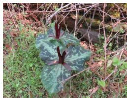
An especially variegated Giant Purple Wakerobin, under alders

The Horse Linto campground was in a small island of oak woodland along the creek among rugged slopes of Douglas-fir ( Pseudotsuga menziesii ). Though the herbaceous part of the forest was erupting green and starting the flower excitement, the deciduous trees and shrubs were still in a winter state. We were looking at their skeletons, a delicate, calm, pastel canopy that let through plenty of light to the woodland floor. Looking at bark, branch pattern, and autumn's fallen leaves, we concluded the oaks were mostly California Black Oak ( Quercus kelloggii ) with some Oregon White Oak ( Quercus garryana ). Checker Lily ( Fritillaria affinis ) was in bud under the oaks, and a handsome Giant Purple Wakerobin ( Trillium kurabayashii ) was showing all its splendor near the creek. Down the road we puzzled over the large "buttons" on the ends of twigs of an oppositely-branched shrub. Later confirmed with photos online, this was an unfamiliar stage of the showy Mountain Dogwood ( Cornus nuttallii ), which we usually recognize by the large, glowing white, petal-like bracts of its flowers. The Black-fruited Dogwood ( Cornus sessilis ) was already blooming, opening its small flowers in loose clusters. We delighted in the extreme discretion of the female California Hazelnut ( Corylus cornuta ) flower.