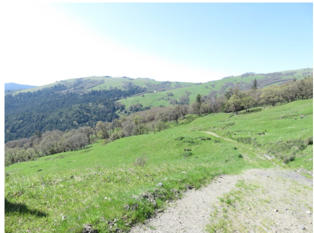
The trail and a Bald Hills vista of prairie, oak woodland, and coniferous forest. The undulating surface of this prairie, with patches of rushes indicating water, suggests the surface layer could be sliding downhill, making it unsuitable for trees.

It was a good day hike through several habitats, including two that need special attention these days. We are grateful for this landscape being protected in a national park, and we appreciate the stewardship the park is giving it.