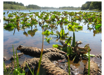
Like monstrous worms, the stems of Yellow Pond Lily lie exposed by the low water level at the northwest end of the lake

In search of a lunch spot, we headed the opposite direction from the boat launch parking area, on a trail through tunnels of willows toward the upwind end of the lake, the only place the shore is not densely vegetated. The trail traversed old dune flats and young dune forest and ended bounding down a sand hill to the gentle shore of the lake. Here we were a bit sheltered and enjoyed our picnic in sight of the boat launch. We sat among a knee-high tangle of Marsh Lotus ( Lotus uliginosus --12-flowered inflorescences, hollow