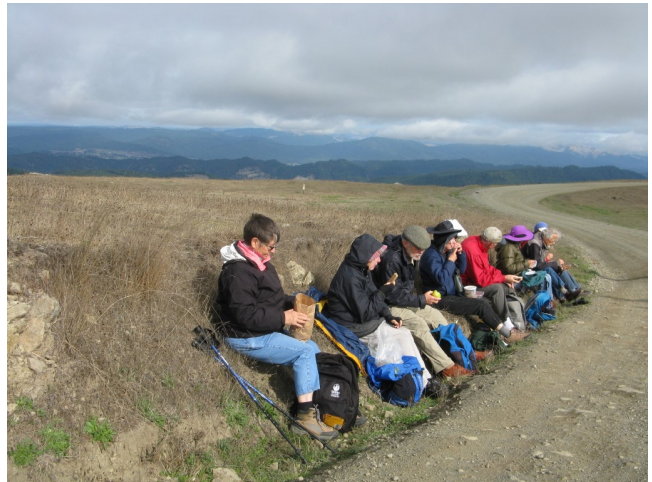
CNPS field trippers shelter from wind on the roadbank and focus on lunch while getting to know the place proposed for wind turbines.

The thin covering of grass and herbs on the ridge was uniformly dry and brown. This was grazing country. Domestic stock have been here a long time. My guess is that the grassland species are mostly non-native. The prairie spread down the south side of the ridge, toward the Bear River. On the north side in some places the front ranks of the forest crept up from the slopes below and walled off the view. Among these trees were some large Tan Oak ( Notholithocarpus densiflorus ), which are suggested to have been important to the Wiyot people who once lived up here.