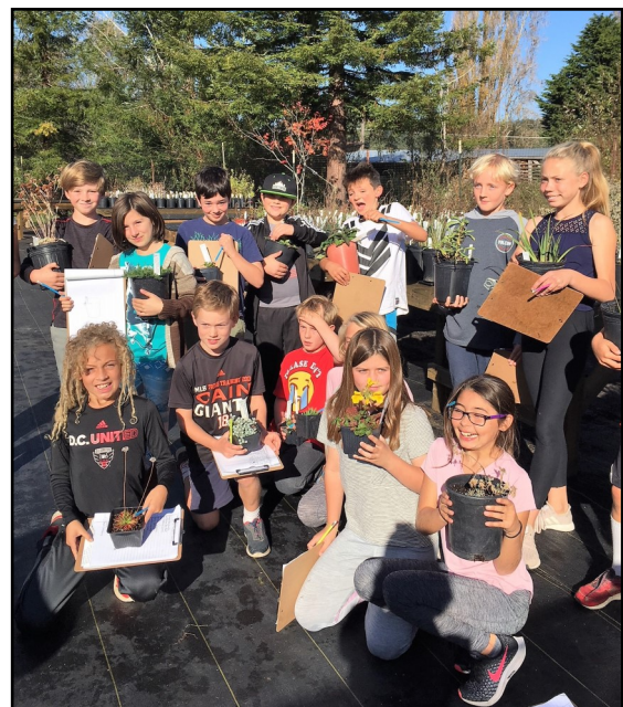
These fifth-grade students at Union St. Charter School researched and then each bought a native plant for their pollinator garden. They are gaining hands-on knowledge about the importance of natives!

In his words, "You can make a beautiful garden that also supports local food webs, sequesters carbon, improves your watershed, and helps pollinator populations all by yourself if you choose productive plants. And your contribution to local ecosystem function plays an important role in sustaining this planet." Such gardens sustain us as well, enriching our lives with a stronger sense of place and the rewards of being attuned to natural processes and seasonal patterns.