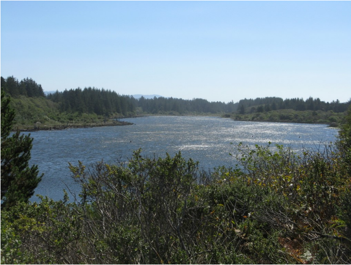
Dead Lake from the northwest end.

In Tolowa Dunes State Park by Crescent City, Dead Lake is a deep, natural pond in a flat expanse of old dunes now a mosaic of willow thickets, shallow ponds, stabilized sand flats, and dune forest. During the logging era this area was an industrial site, using Dead Lake as a log pond. The devastation must have been total, but nature has now covered it with diverse, lush greenery, most of it native. As nine botanizers gathered at the Dead Lake boat launch, hoping to explore by canoe and kayak, we saw a problem. White caps driven by a lusty northwest wind raced the length of the lake. We quickly revised our exploration to be the wet foot sort, around the edges of the lake.