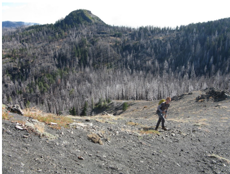
The charred landscape between Black Lassic and Red Lassic.

The dominant feature of the landscape was the charred aftermath of the 2015 fire, which burned thoroughly here. Picturesque skeletons of conifers and gnarled shrubs were everywhere. The harsh soils produce barren landscapes in lush years. Now any stands were reduced to barrenness. In fact, the most barren landscape we traversed, the slopes of Black Lassic, suffered no fire damage.