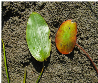
Leaves of Floating-leaf Pondweed (left) and Watershield (right)

On the shore we stood on Silverweed ( Potentilla anserina ) and discovered at water's edge it's less common cousin, Marsh Cinquefoil ( Comarum palustre ). We could reach the nearest tall emergents that grew near shore-- Hardstem Bulrush or Tule