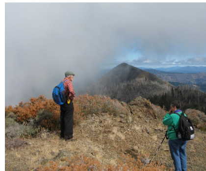
Black Lassic seen in the distance from the top of Mt. Lassic.

Since the 1990's CNPS has been a partner with Six Rivers National Forest in studying and protecting the Lassics Lupine. Monitoring by a CNPS member first clarified the damage OHVs and cows were doing to the lupine. The Forest Service removed rogue roads, placed boulders, and removed cows. CNPS worked with the Forest Service through subsequent years to follow the lupine individuals and population, study the rodent problem and install temporary cages, and study soil conditions, and vegetation changes. A CNPS member successfully petitioned the State of California to list the Lassics Lupine as state endangered. It was an honor and a