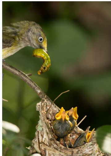
A White-eyed Vireo feeds a caterpillar to its nestlings. Each songbird relies on thousands of insects like this to survive and produce young.

In September 2018 the Associated Press released an article entitled "Bye bye bugs? Scientists fear non-pest insects are declining" ( Times-Standard , September 23, 2018). The study noted that scientists in the U.S., Canada, Costa Rica, Germany, Denmark, and Greenland who study beneficial flying insects such as bees, moths, butterflies, ladybugs, and fireflies are reporting declining populations. One study estimated a 14% decline in ladybugs in the U.S. and Canada from 1987 to 2006, while a 2017 study of 63 nature preserves in Germany found an 82% mid-summer decline in the number and weight of bugs compared to 27 years earlier.