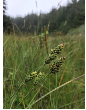
C. buxbaumii.

A richer understanding of some of northern California's most common and rare sedges.