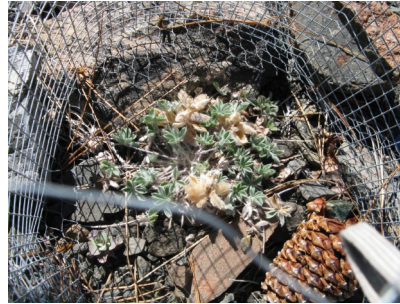
A Lassics Lupine in its protective cage.

this trip to show us, says aerial photos from the 1940's show no brush on Mt. Lassic. The current patches are called "encroachment," another example of the unintended consequences of years of fire suppression. These shrubs are native, but their presence turns out to be important to the Lassics Lupine. The brush harbors mice and chipmunks which enjoy eating lupine seeds and new growth. The brush also carries fire. The